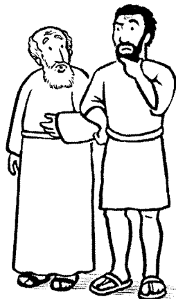
The man is happy now he can see. Many people could not believe what had happened.