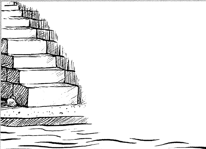
The blind man washes in Siloam pool and is able to see.