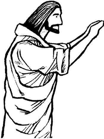
Jesus smears mud on the eyes of a man who was born blind.

Draw the story of Jesus healing the blind man