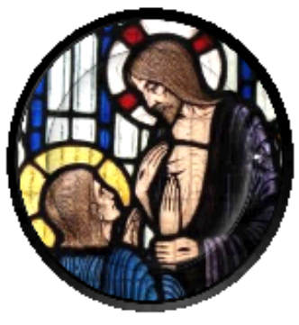
"My Lord and My God!"

Church & Parish Office: 5 Fiorelli Blvd, Cranbourne East 3977